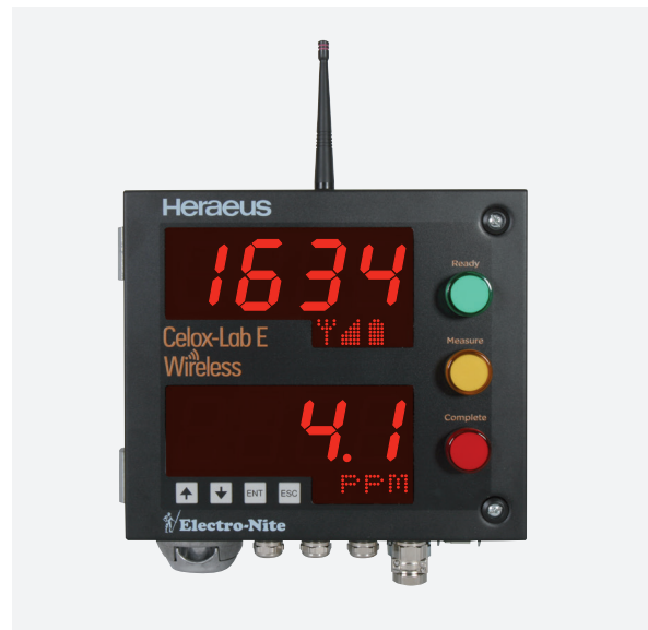
Celox-Lab E Wireless